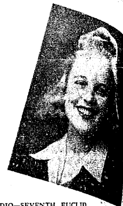
PORTRAIT STUDIO—SEVENTH, EUCLID